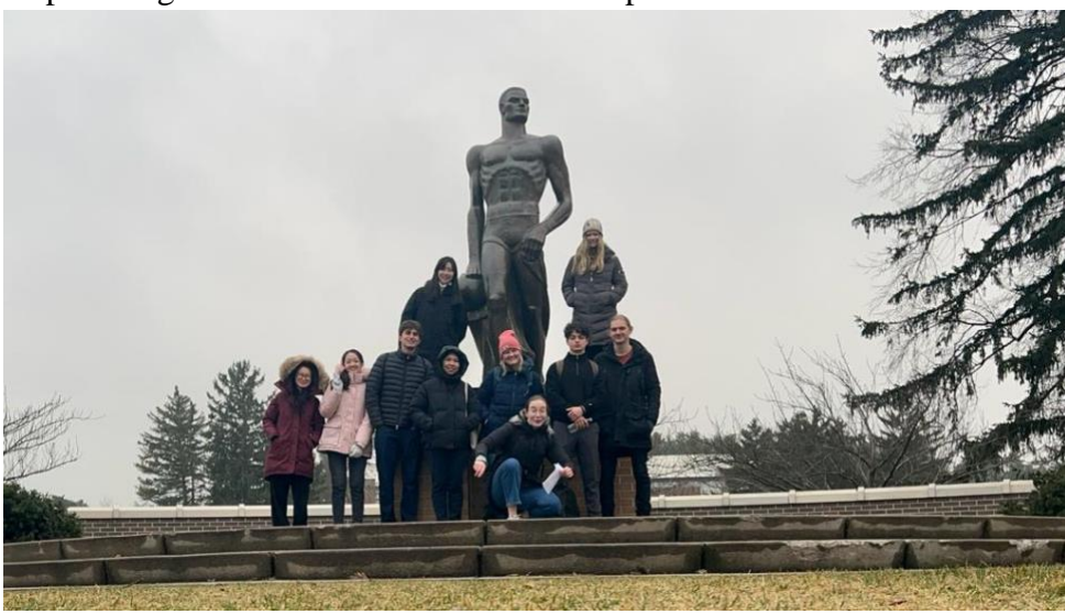
(Taken on Jan 6 with other exchange students during the campus tour.)

I arrived in East Lansing on January 4, 2023. Michigan State University was such a large campus that I could hardly find my way. Fortunately, I met two MSU students who helped me with dorm check-in and getting into my next few months of life here. On January 6, there was an orientation for ASP&E students. After presenting some necessary information that we exchange students should know, there was a campus tour afterwards in the afternoon. It helped me get more familiar with MSU campus.