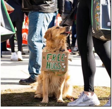
(Welcome back to campus after taking a break from the heartbroken moment)