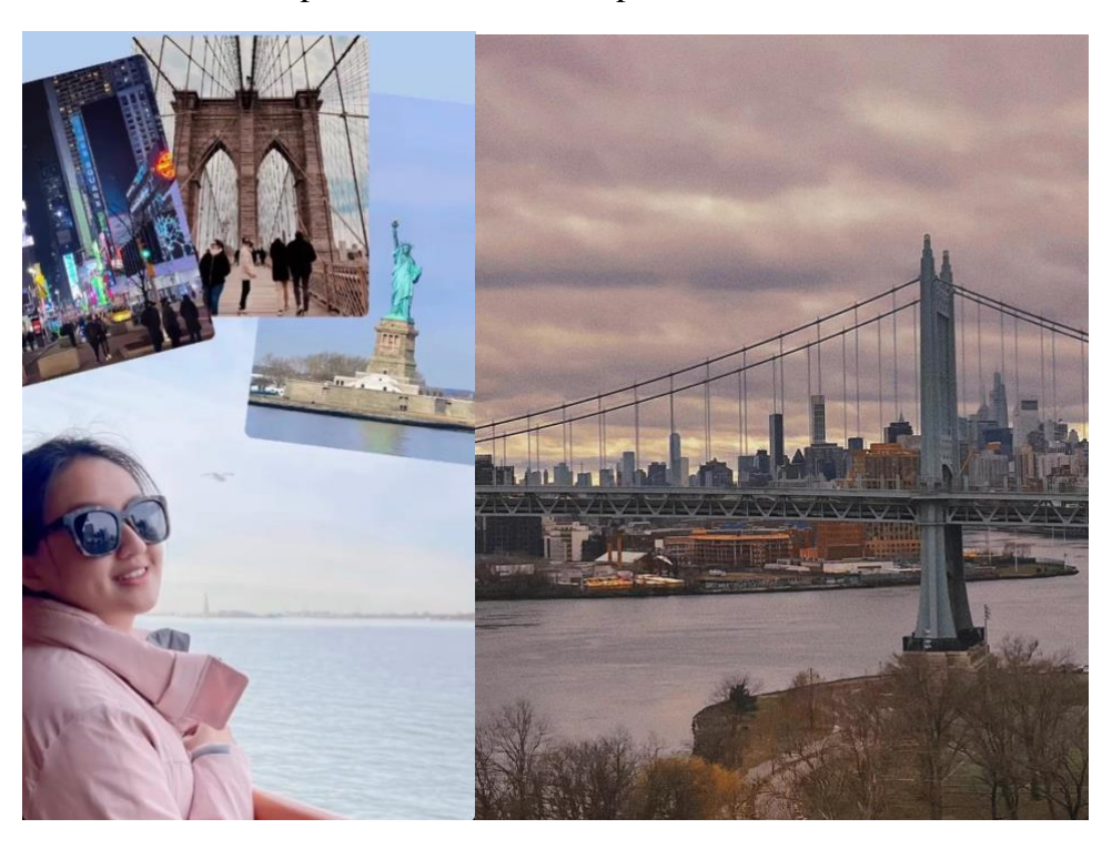
Apr - Finals and Presentations

During the nearly ten-day break, I had the opportunity to explore both New York and Boston with a group of friends. It was the perfect occasion for students like us to venture beyond the confines of the campus and discover new places.